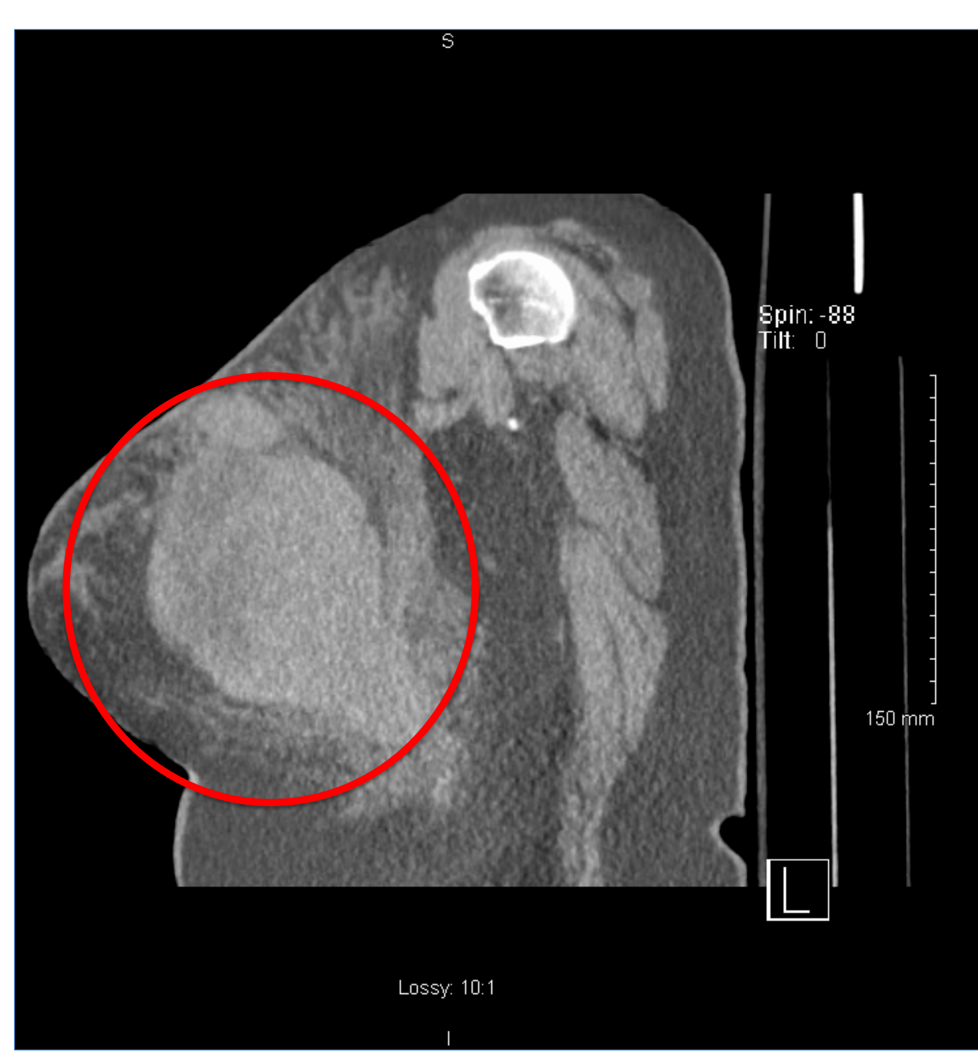
Image 3. CT scan of the chest revealing large right breast hematoma.