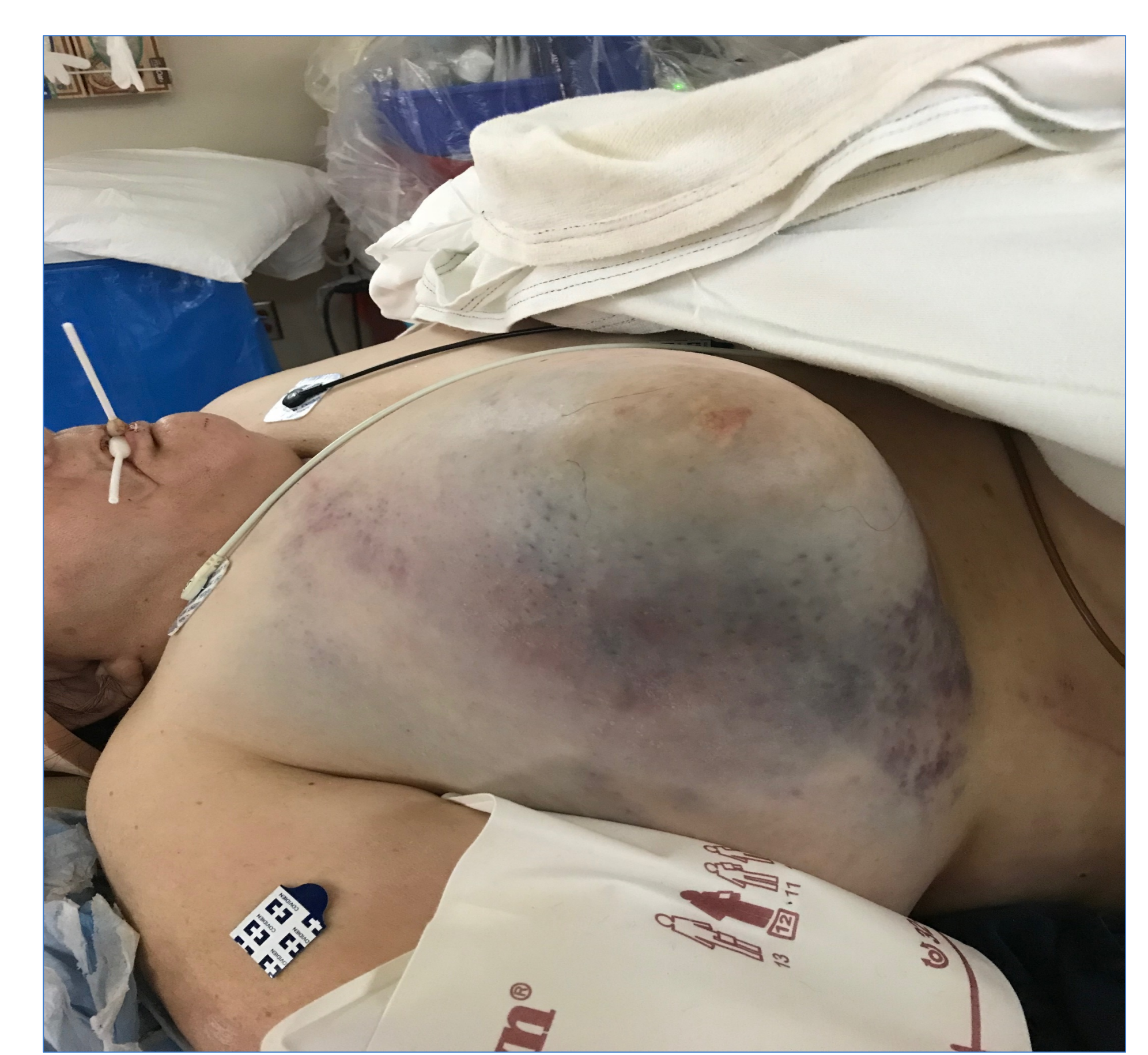
Image 1 . Photograph of patient showing massive right breast hematoma.

Upon presentation to the emergency department, she was complaining of severe right breast pain. She was tachycardic (BP: 128/60, HR: 110-120, RR: 18). Her primary survey was only significant for ecchymosis to her right breast. Her right breast was swollen, tense and exquisitely tender (Image 1). No further evidence of trauma was noted.