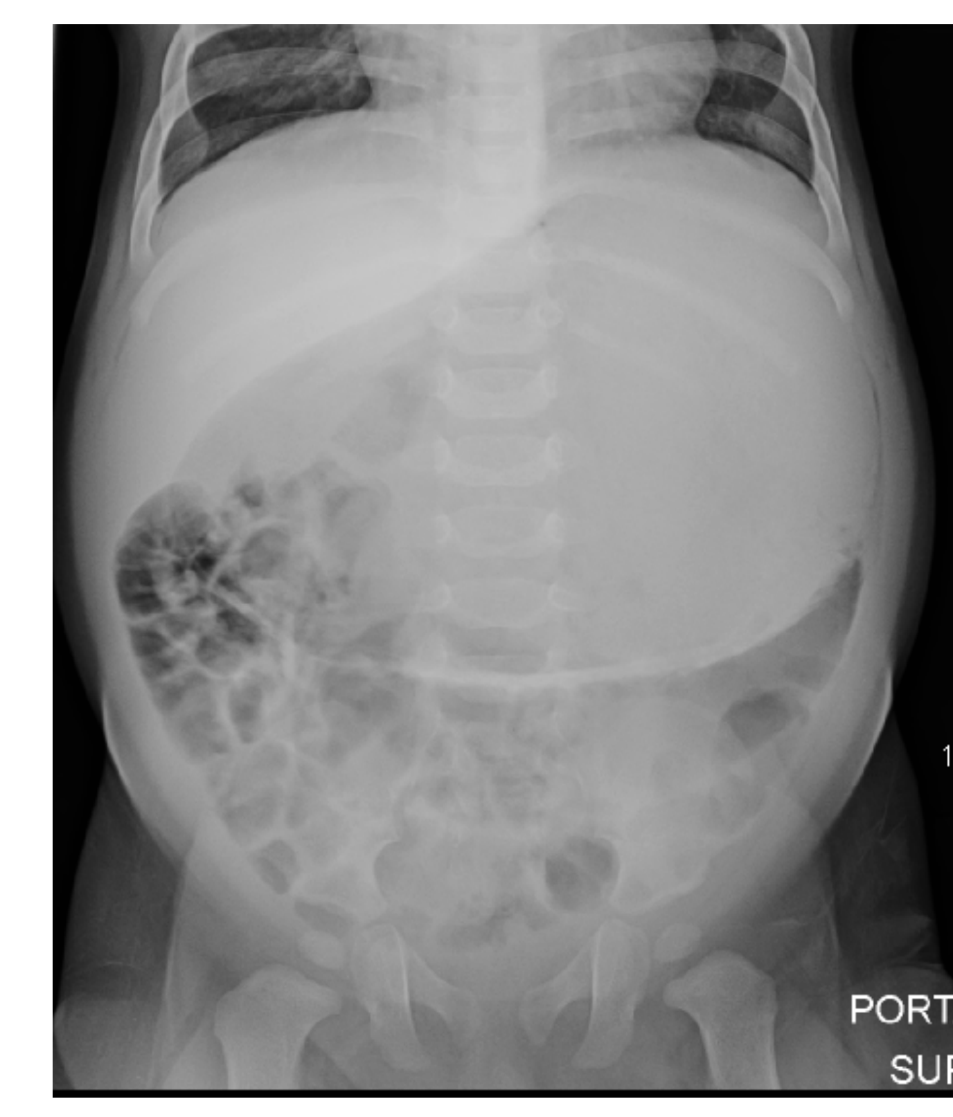
Image 1. KUB of a 11-month old male with evidence of severe abdominal distension indicative gastric volvulus.