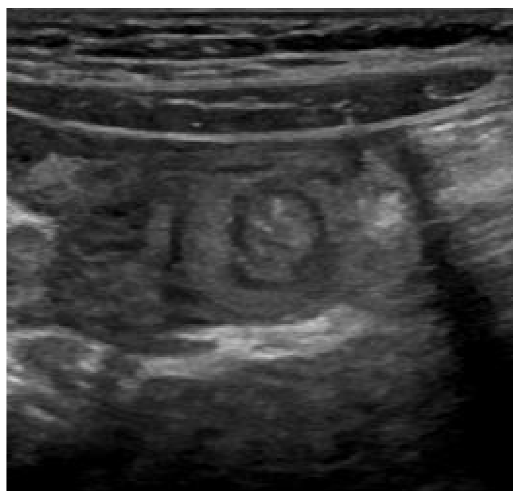
Fig. 3. Sonographic image demonstrating small bowel intussusception as the classic "target sign".

The patient was transferred to Valley Children's Hospital in Madera for higher level of care. Repeat KUB upon arrival was performed which showed gastric decompression with NG tube extending into stomach. An abdominal ultrasound showed transient small bowel to small bowel intussusception in the left lower quadrant which spontaneously reduced during the course of the examination (Image. 3).